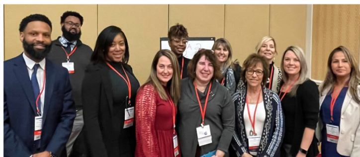
Picture of Area 2 Family Members -Washington DC, MD, PA, DE & VA